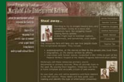
Figure it Out

GREAT FOR: Working with primary source documents.